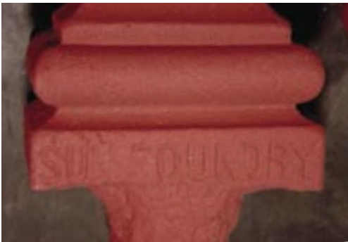
Image: Trademark of Saracen Foundry / Sun Foundry.