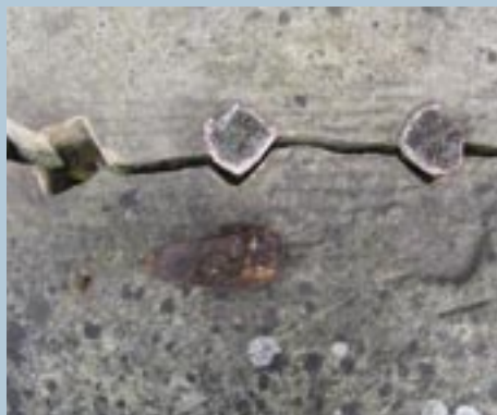
Image : Damage to masonry copes from wrought iron 'corrosion jacking' railing stubs

The removal of original railing stubs from boundary walls can be straightforward, or this may previously have occurred during the war effort, leaving a socket that can be re-used. Removing this stub and its lead surroundings can occasionally be more problematic, although not impossible. A decision should be made on balancing the ease of removal against damaging the adjacent stone. Another option is to drill out the original using a larger diameter core – but this needs to be carefully done without enlarging the socket too much. Leaving the stubs in place and installing the new ironwork between the original fixings can be employed, but very much depends whether the original design lends itself to this. Each individual casting should be secured into the masonry as originally fixed. The insertion of a lower bar, horizontal to the wall, is not recommended.