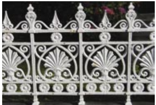
Image: Railing Spears with cope rail and baluster / railing panels. © D S Mitchell