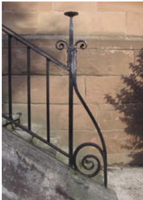
Edwardian Wrought Ironwork in Glasgow.