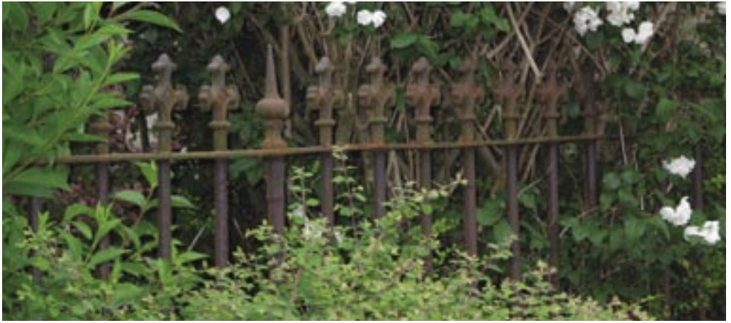
Image: Run of original railings left in street as a reference in 1942.

railing spears, grouped stubs possibly baluster panels), and the original shape if it was round, square or fluted. A regular newel or baluster post which is heavier and more structural may be found at regular intervals in railings.