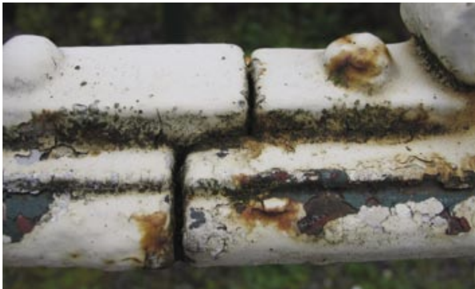
Image: Traditional cast iron joints owe much to woodworking principles

cost of such work with neighbours who have similar needs can be a useful economic approach. The foundry may offer a discount on the pattern if they retain ownership of it on completion. Ironfounders usually undertake the manufacture of castings, and some of them also use their own staff to install their products. You might prefer to use a reputable ironwork specialist, or blacksmith, who has appropriate experience and who can source castings on your behalf.