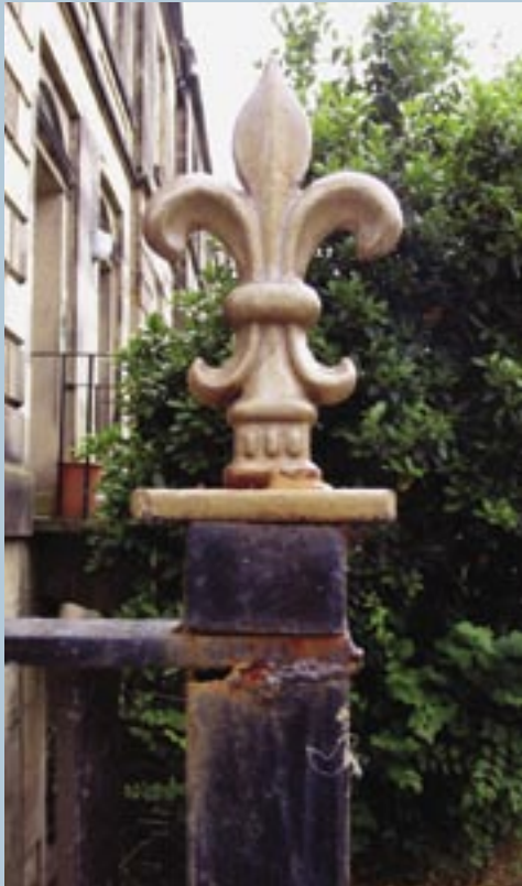
Image: poor quality replica in steel.

Combinations of cast and wrought iron are not unusual. There has also been much 'replica' ironwork re-instated to imitate cast iron railing spears in particular. Most utilise steel bars and cast steel, or cast iron heads, welded together. Much of this work is poorly executed, employing modern fabrication techniques and modern materials with inappropriate designs.