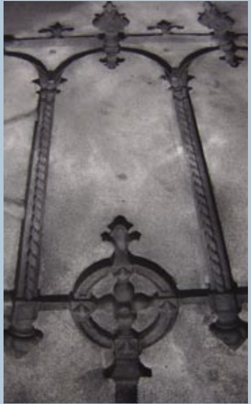
Image: Open greensand mould for baluster panel.

Original castings were made from stock wooden patterns in grey iron, moulded in sand by hand. Molten iron was poured into the mould to create a standard casting. Wrought iron was manufactured from cast iron through the puddling (heated and hammered to create an iron rich fibrous material) process. Unlike cast iron with its rigid structure, wrought iron is a wonderfully workable material in skilled hands at the forge.